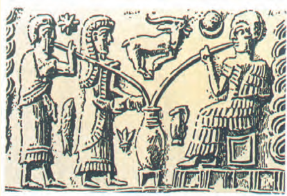
Beer drinking Babylonians almost 4.000 years ago

A great many stories have grown up around the origins of Smokebeer. Some are quite imaginative, others are a bit strange. The majority can be considered fairy-tales and fables.